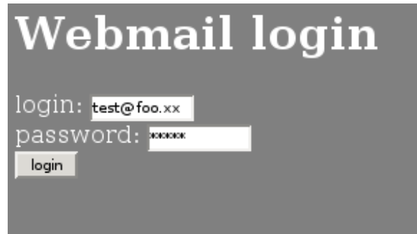
Figure 5: login

Now that we know how FreePOPs will act during the login we have to implement the login in the webmail, but first uncomment the few lines in the init() function (that is called when the plugin is started), that loads the browser.lua module (the module we will use to login in the webmail). Here is the webmail login page viewed with Mozilla and the source of the page (you can see it with Mozilla with Ctrl-U, figure 5).